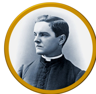
Blessed Fr. Michael McGivney

3259 Old Goldie Rd. Oak Harbor, WA 98277