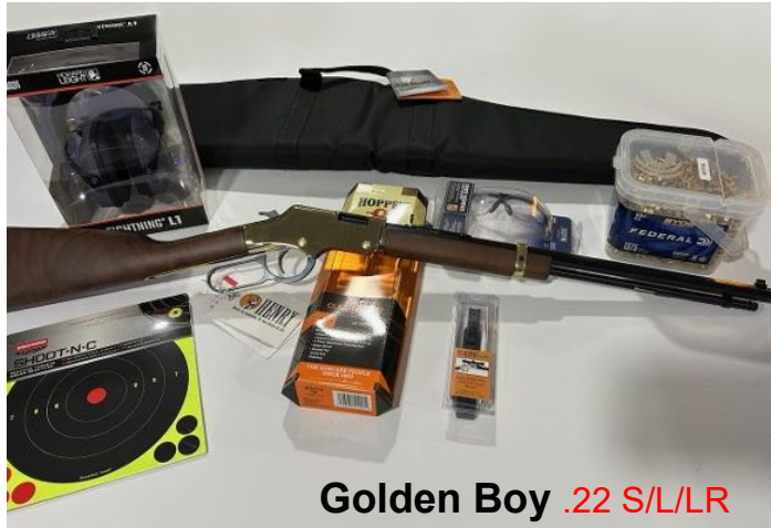
Golden Boy .22 S/L/LR