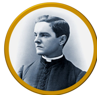
Blessed Fr. Michael

Father John E. O'Brien Council #3361, 3259 Old Goldie Rd., Oak Harbor