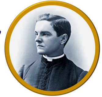
Venerable Fr. Michael McGivney