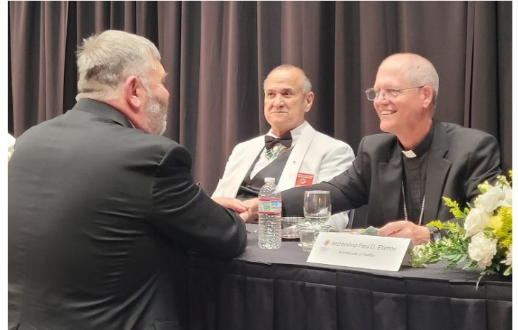
GK w/ Archbishop Etienne. GK gave a 3361 Coin the archbishop.